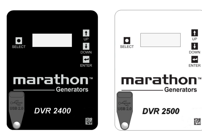
Figure 2. DVR2400 and DVR2500 HMI Shown